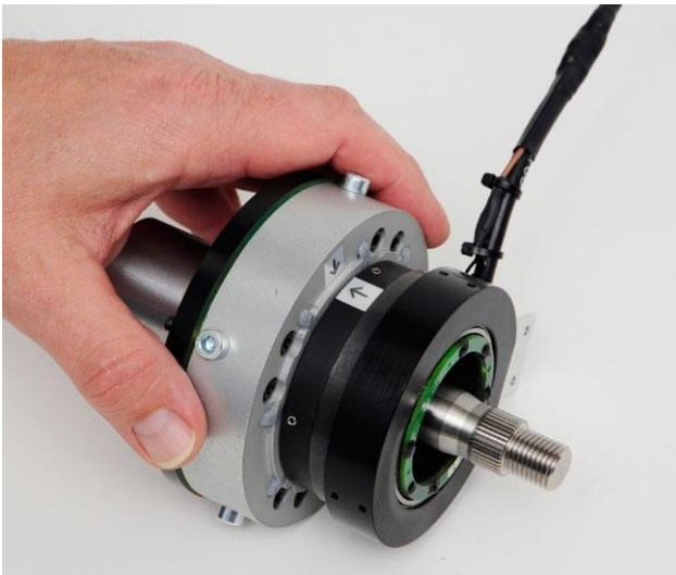
Small, flexible and high-precision: The new steering effort sensor KMT-CLS

Measurements at the original steering wheel of automobiles and trucks