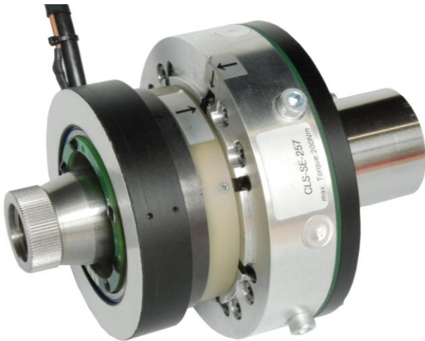
Small, flexible and high-precision: The new steering effort sensor KMT-CLS

Measurements at the original steering wheel of automobiles and trucks