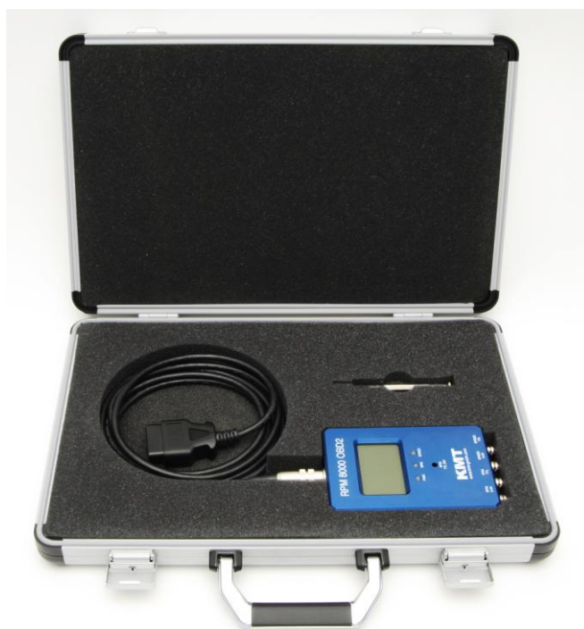
RPM8000OBDD2 – in transport case

Dimensions: 150 x 100 x 30mm Weight: 0.5kg without connection cable Material: anodized aluminum Operating temperature: -20°C to +70°C Storage temperature: -30 to +80°C Humidity: 20 – 80% Vibrations: 5g Shock: in all directions 100 g